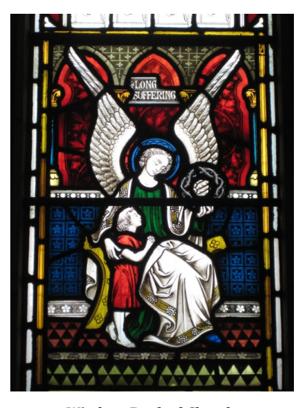
Window. Bayford Church

Company member of the Master Locksmiths Association