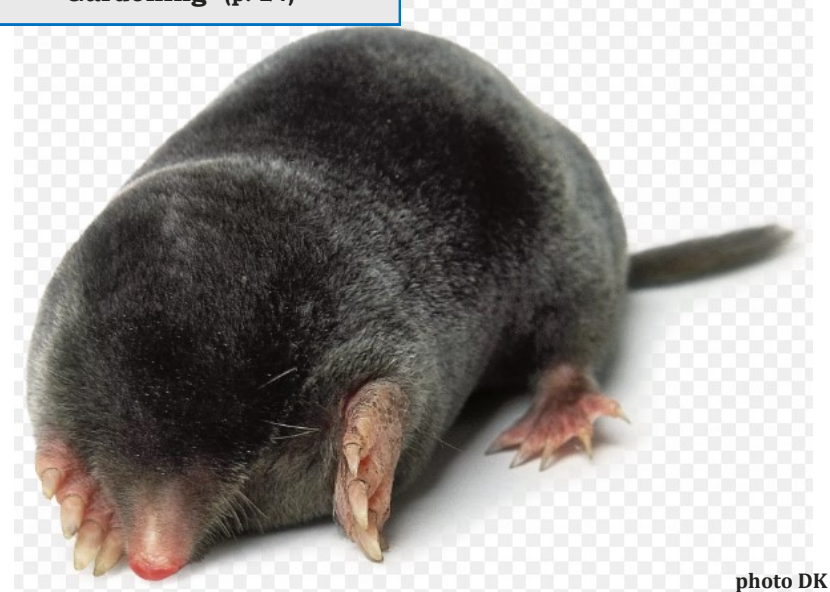
'The little gentleman in velvet '. (p. 25)

This month several articles and photographs look back on the icy weather, including 'Nature Notes' (p. 25) and 'Gardening' (p. 24)