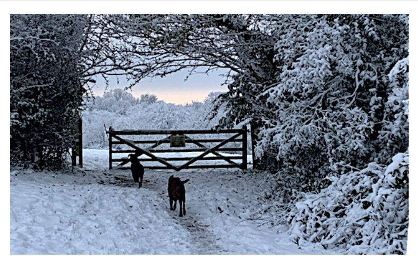
The cold days of snow and ice seem a long way away now, (hopefully!) but they did give the opportunity for some excellent photographs.