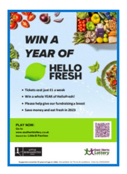
Join in and get 2023 off to a healthy start!